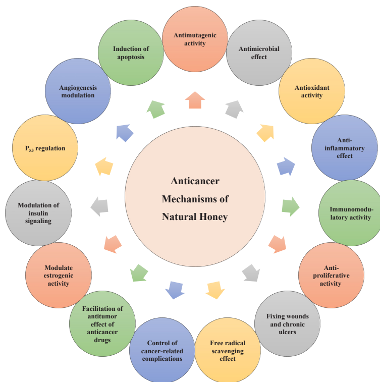
Figure 3. The main proposed anticancer mechanisms of natural honey.

During production, collection or processing, honey may be contaminated by microorganisms from bees, plants, and dust. 10 To warrant its high quality, prolong its shelf life, and maintain its freshness, honey is usually processed by heating or sterilizing. Heating leads to the formation